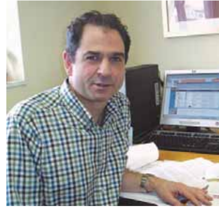
The protein fibronectin is a scar protein critically involved in kidney failure.

they call the "one protein one gene" theory; the underlying concept for this was initially proposed in the 1940s and has been modified a little since but basically the idea is that every protein in the body is coded for by a separate gene.