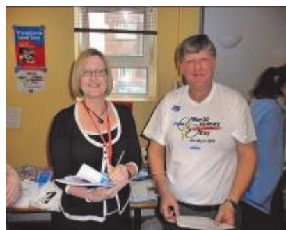
Deputy Director of Nursing, reaffirming her organ donor registration